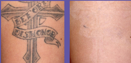
Before & After 4 Treatments