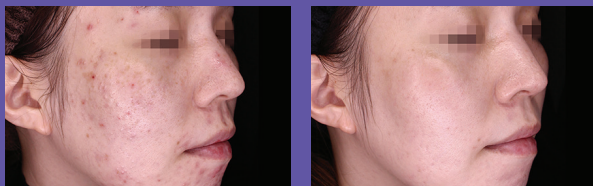
Before & After 3 Treatments