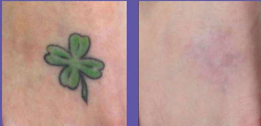
Before & After 3 Treatments

An award-winning device with award-winning results/