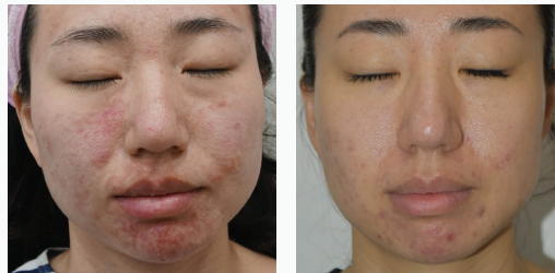
Before and after 3 treatments