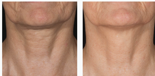
Before & after 1 treatment