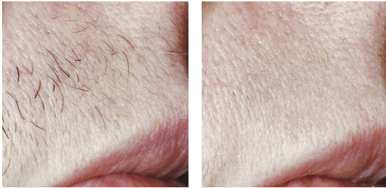
Hair removal before and after 3 treatments