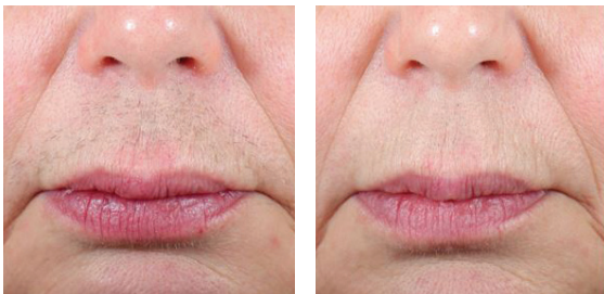
Hair removal before and after 2 treatments