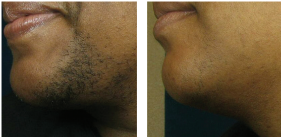
Hair removal before and after 2 treatments